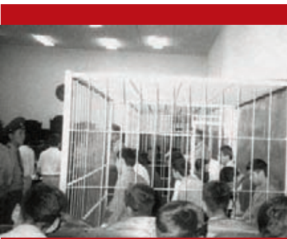
ABOVE: Tashkent Supreme Court.