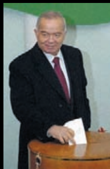
LEFT: President Karimov voting, 2000.

The government tightly controlled the mass media and suppressed any criticism. The government did not observe citizens' right to free assembly or association. Police regularly detained citizens to prevent public demonstrations and forestalled contact with foreign diplomats.